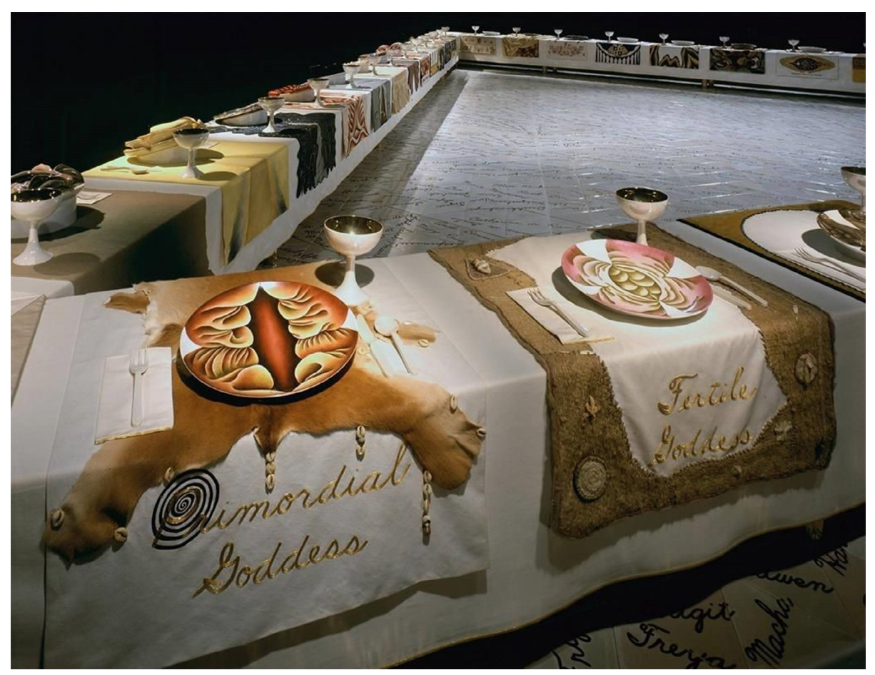
Judy Chicago: The Dinner Party, 1979.