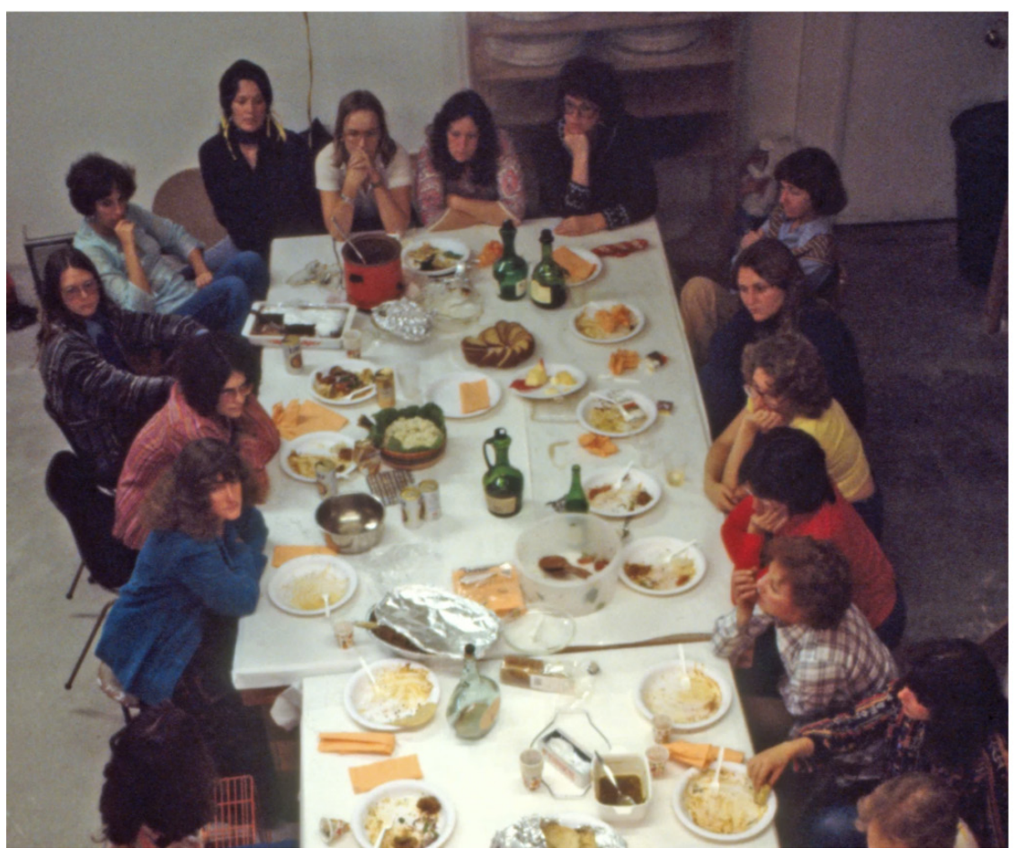
Thursday Night Potluck with "The Dinner Party" Workers, 1978.