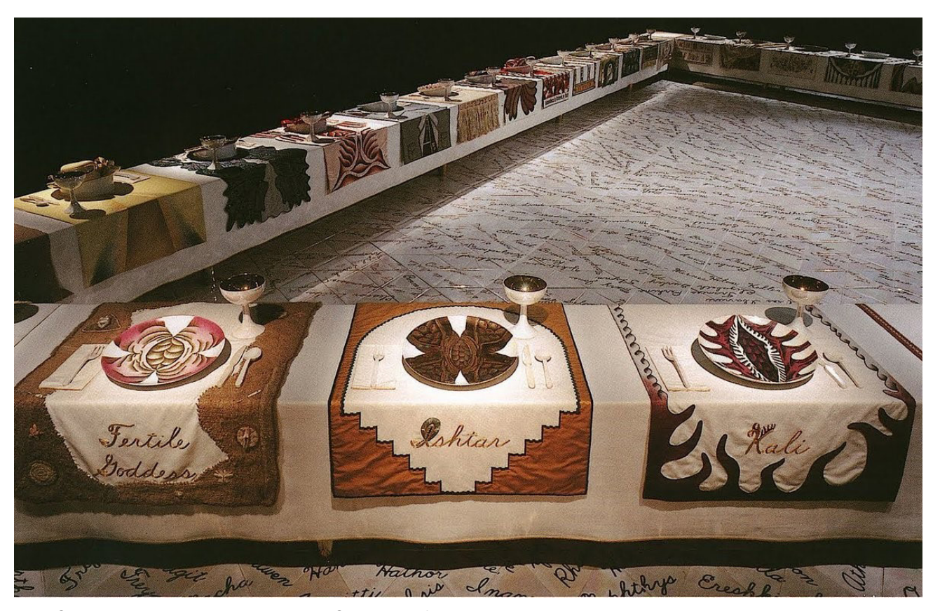
Judy Chicago: The Dinner Party, 1979.

In an article she wrote for The Guardian in 2012, where she reveals her personal motivation in entering the art world and the women's movement, she admits: "The truth is that for centuries women have struggled to be heard, writing books, making art and music and challenging the many restrictions on women's lives. But their achievements have been repeatedly written out of history...... I set out to chronicle this on-going erasure in my installation <u>The Dinner Party</u>, a monumental, symbolic history of women in western civilisation. It created a major stir when it premiered in 1979. Originally slated to travel to a number of museums, the tour collapsed in the face of vitriolic reviews, sometimes (sadly) written by women."