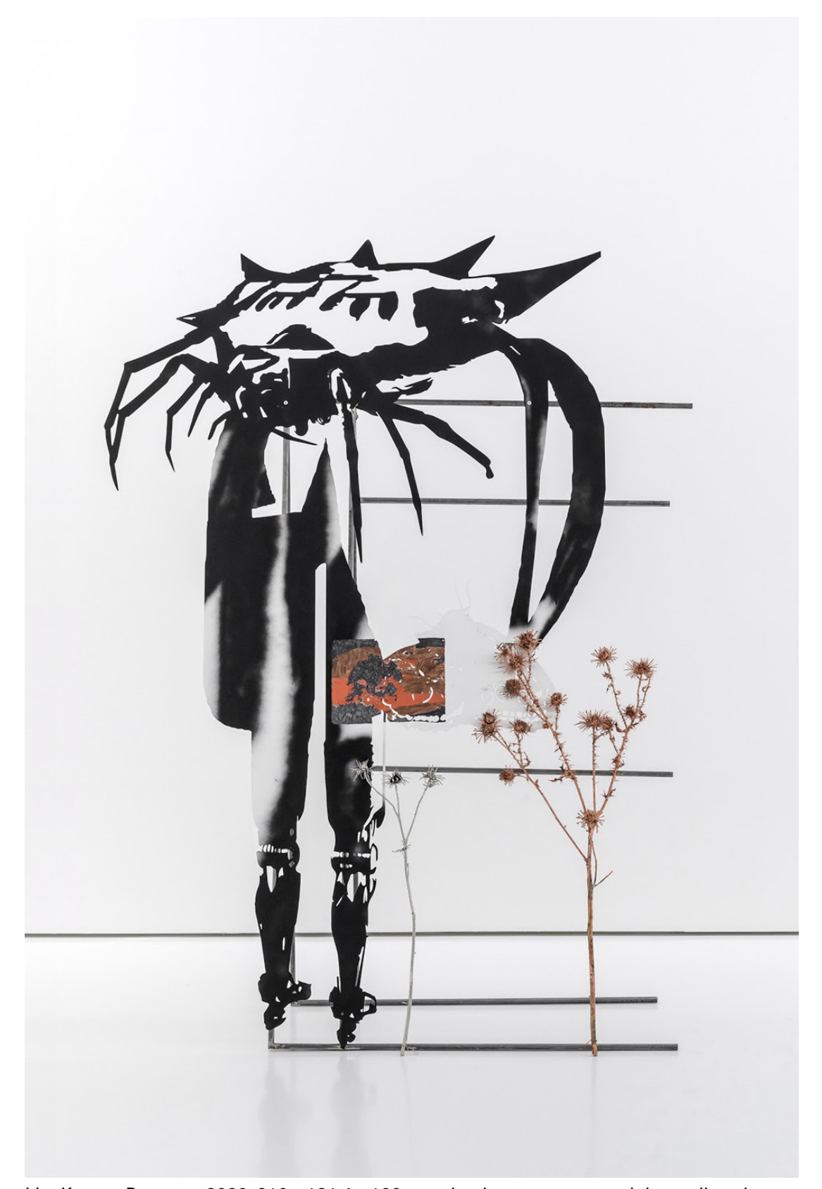
Lito Kattou: Dreamer, 2020, 210 x 131,4 x 100 cm, aluminum, permanent ink, acrylic paint, electroformed copper, nickel-plated copper. Courtesy of the artist and Galeria Duarte Sequeira, Braga. Photo: Andriano Ferreira Borges